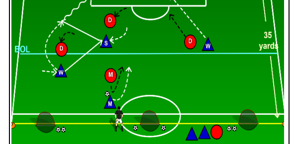
LESS CHALLENGING: 3v3 to goal - 2 small goals

Note: Switch to the Less Challenging activity if it is too difficult or to the More Challenging if it is too easy.